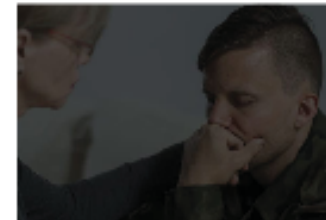
CBD Success Stories about Post Traumatic Stress Disorder