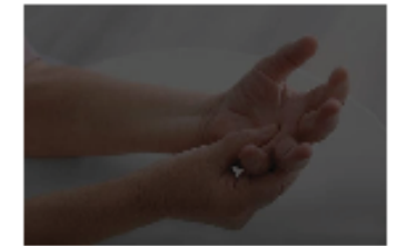
CBD Success Stories about Arthritis & Fibromyalgia