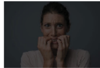
CBD Success Stories about Anxiety

Want to see what CBD can do for you? Click on a category below to read the testimonials of people who have already experienced the transformative power of Koi CBD.