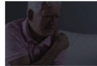
CBD Success Stories About Chronic Pain