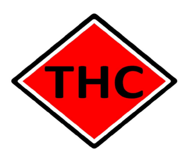
Contains Marijuana. Keep out of the reach of children.